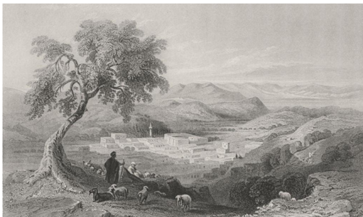
Drawing of First Century Nazareth

Welcome to the world of the gospel. Expectations are there to be shattered. Presuppositions exist to be undermined. And what if that upside-down reversal of anticipation was as true for the people of our world today as it is for those in the first century?